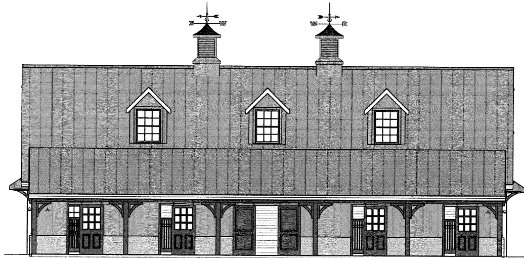
E3 ELEVATION SCALE: 1/4" = 1'-0"