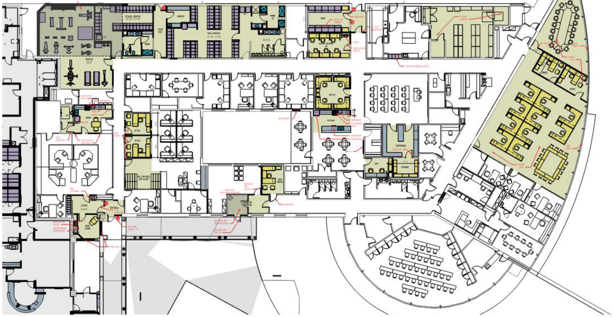
1 FLOOR PLAN - REFERENCE SCALE: 1/8" = 1'-0"