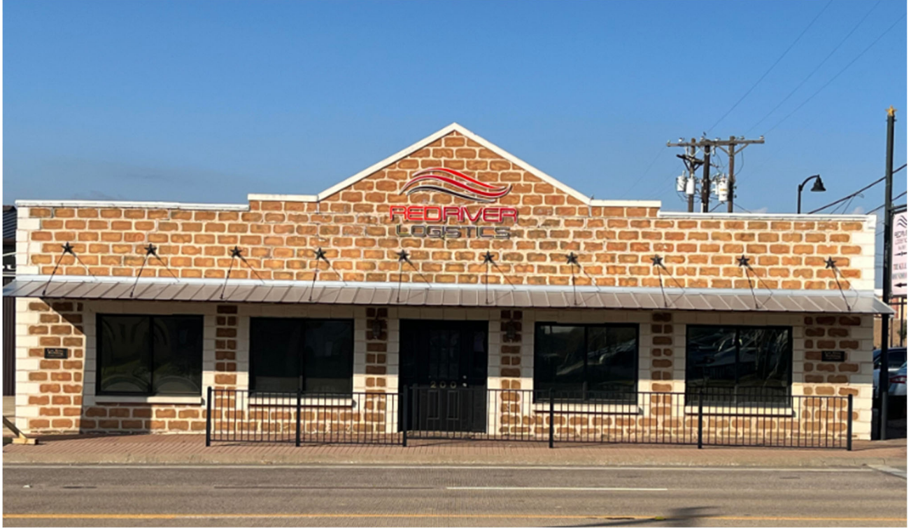
New Paint - still waiting on signage