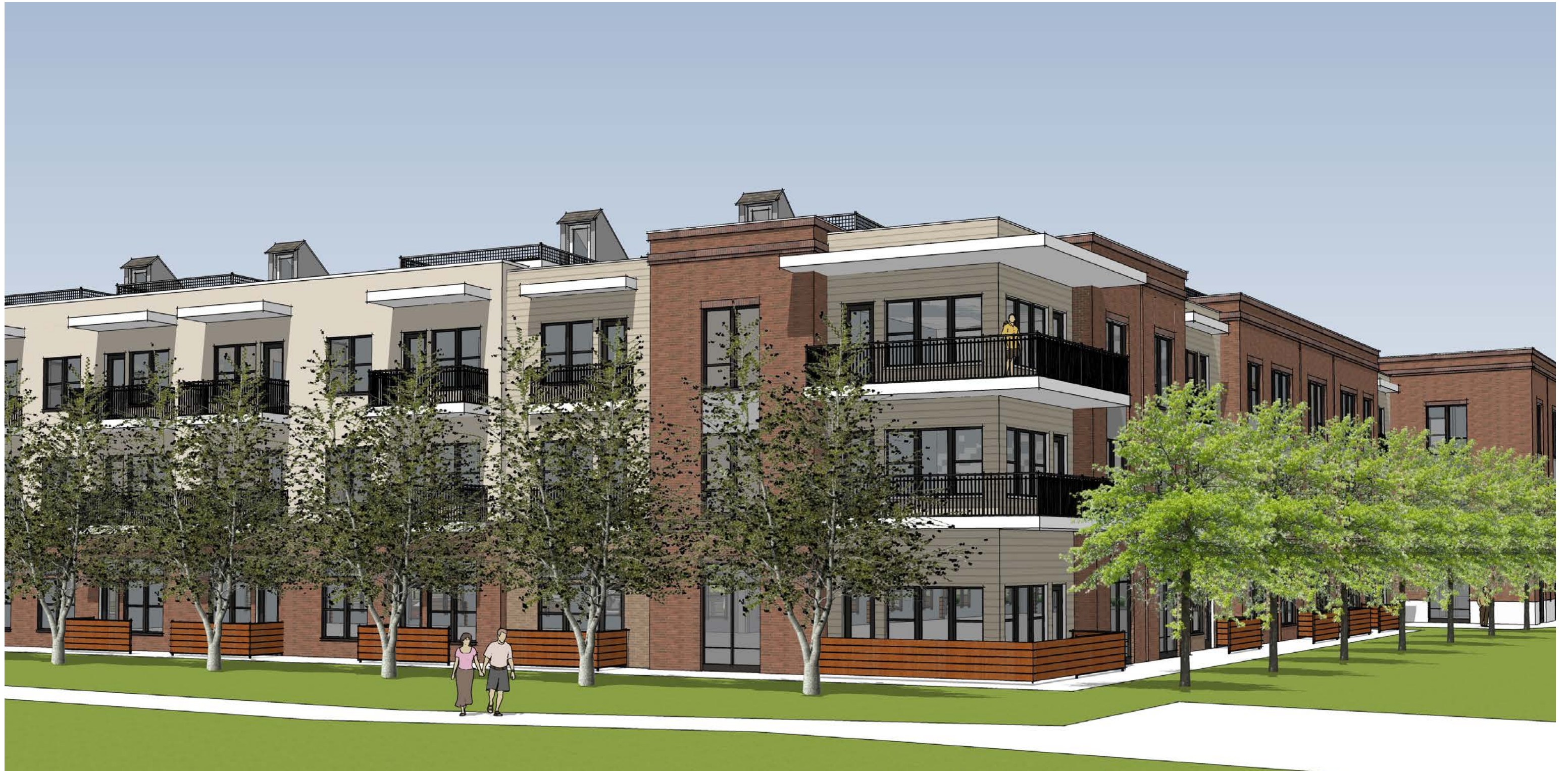
VIEW OF SOUTHEAST CORNER

27 SEPTEMBER 23 ©2023 WILDER ARCHITECTS, LLC