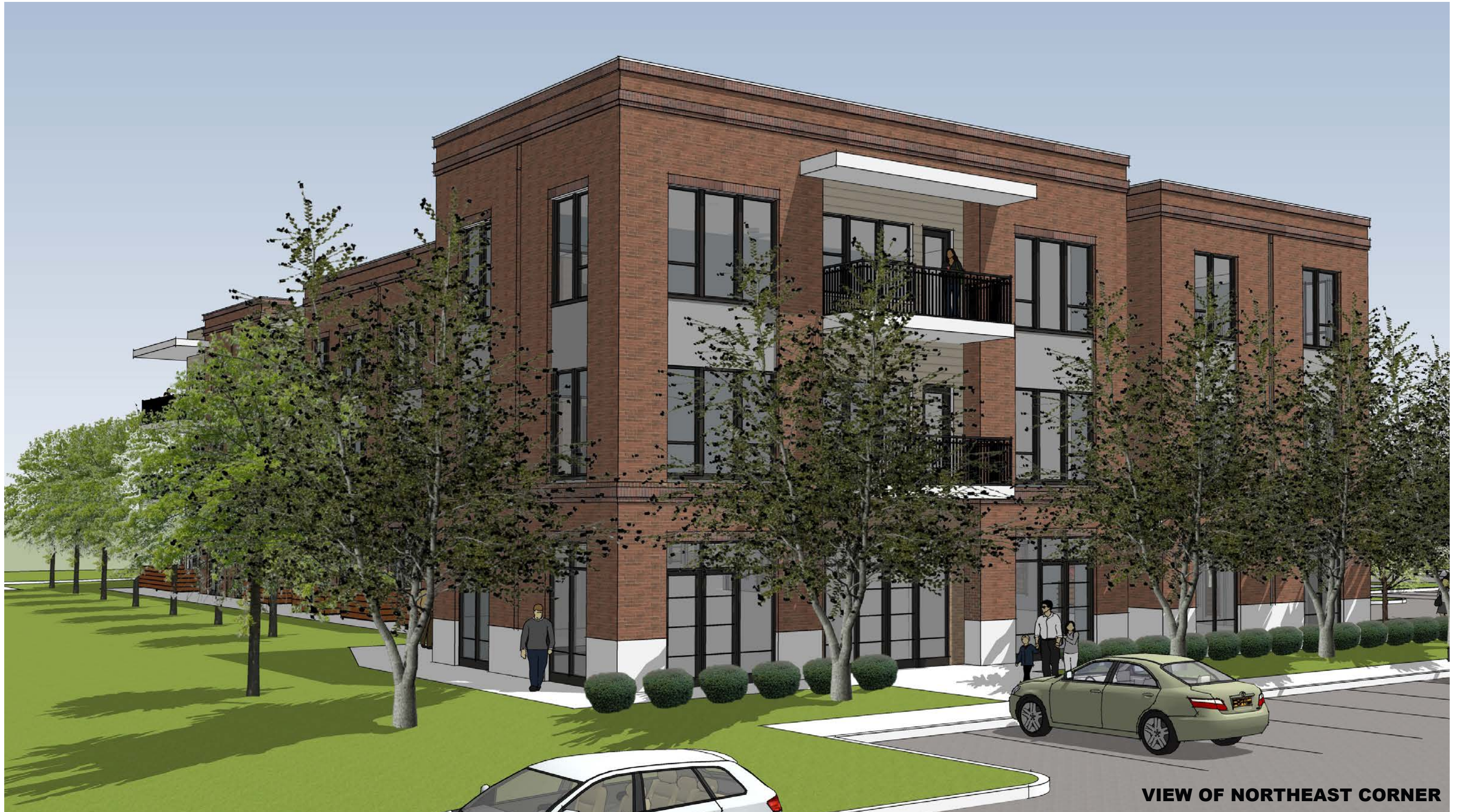
VIEW OF NORTHEAST CORNER

27 SEPTEMBER 23 ©2023 WILDER ARCHITECTS, LLC