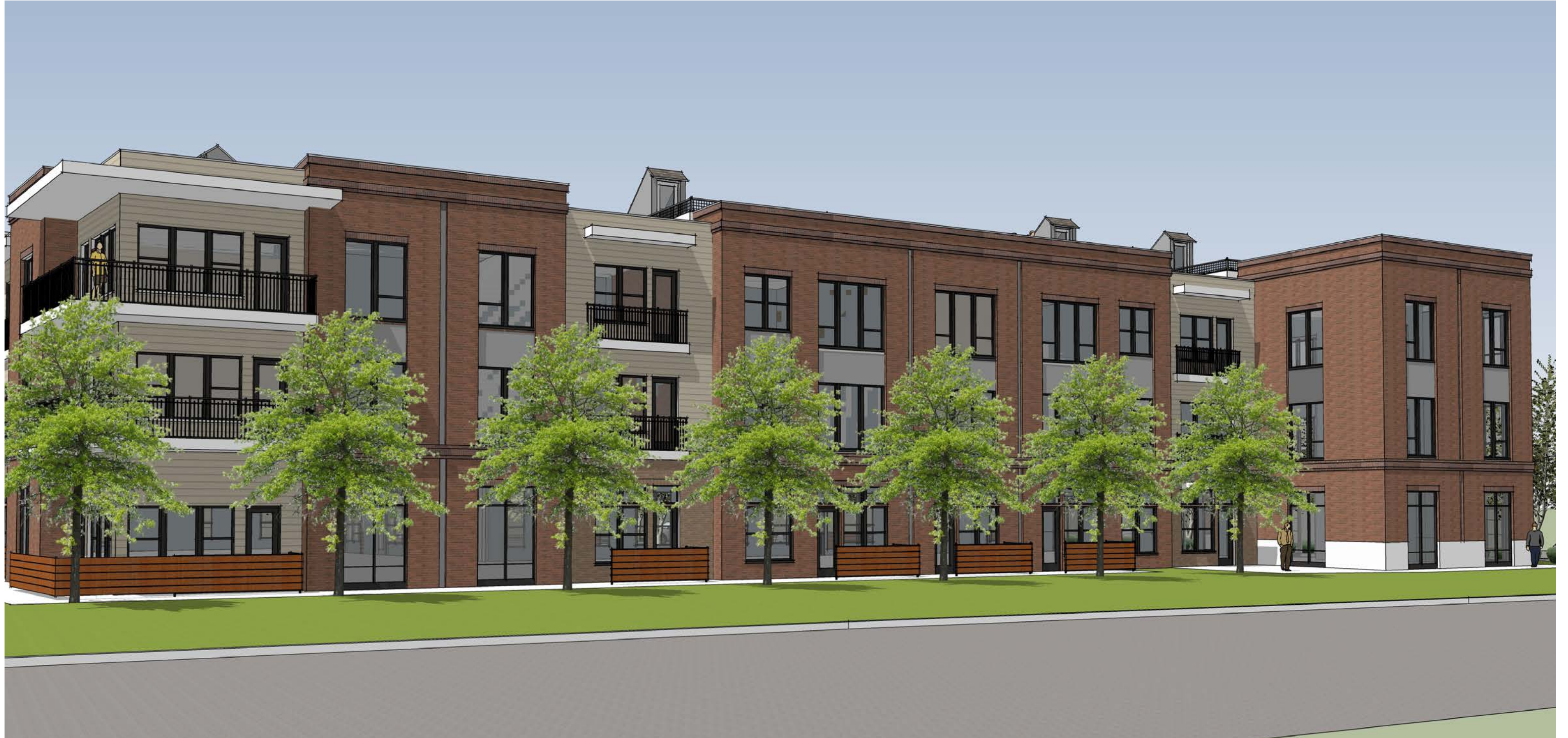
VIEW OF EAST ELEVATION

27 SEPTEMBER 23 ©2023 WILDER ARCHITECTS, LLC