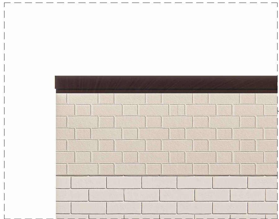
FLEMISH BOND COURSING BAND