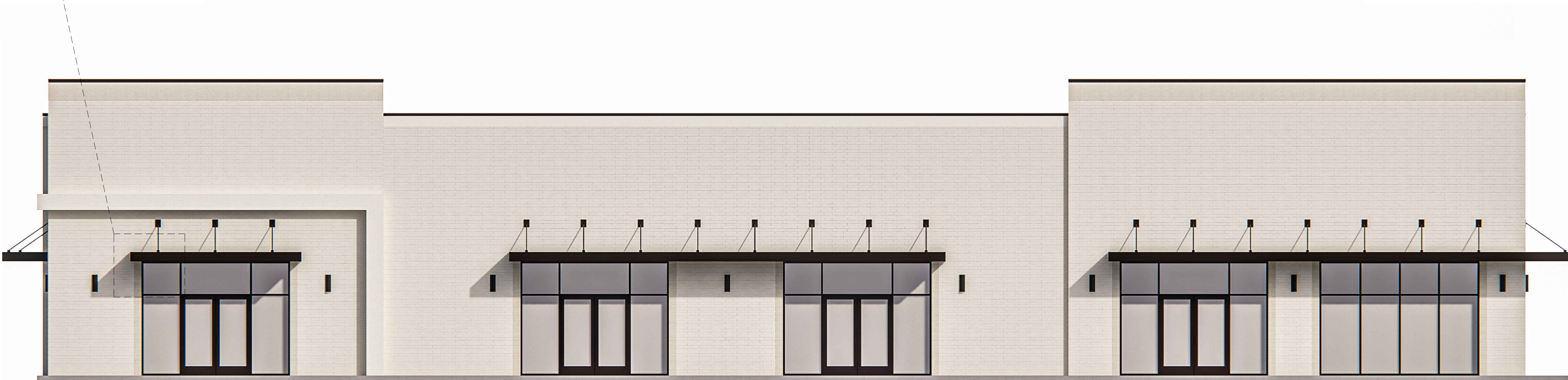
2 SOUTH ELEVATION SCALE: 3/16" = 1'-0"