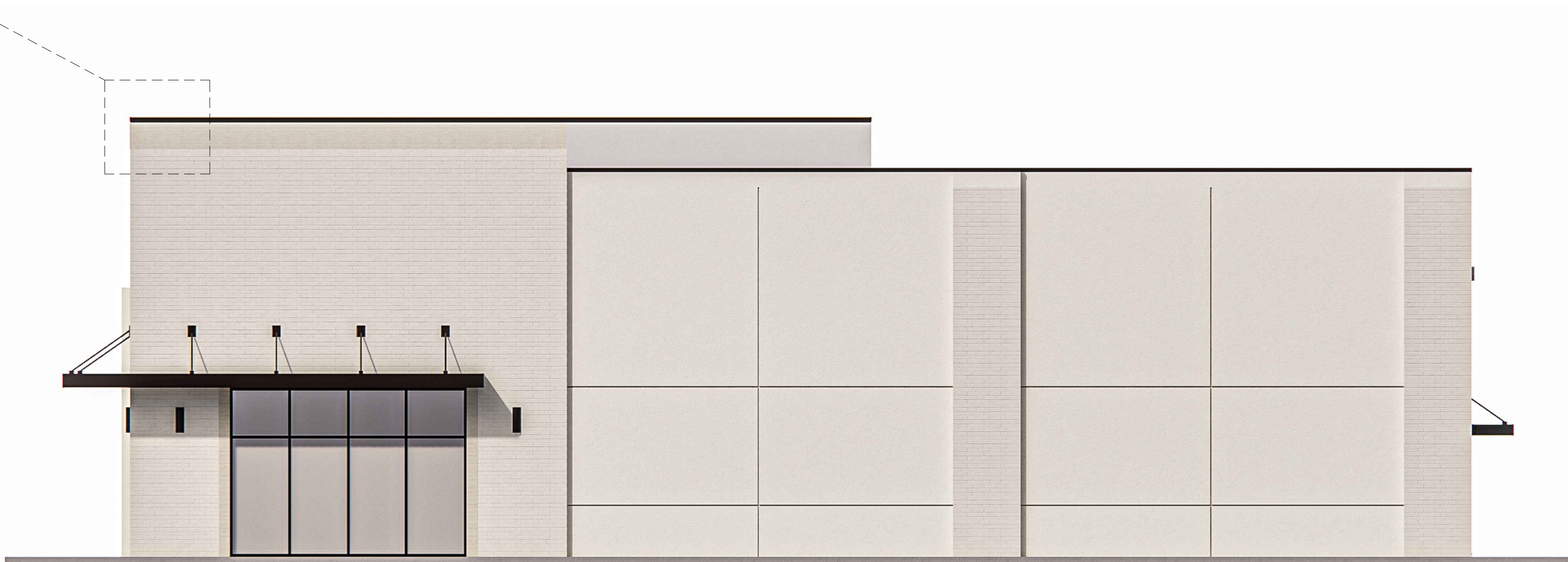
1 EAST ELEVATION SCALE: 3/16" = 1'-0"