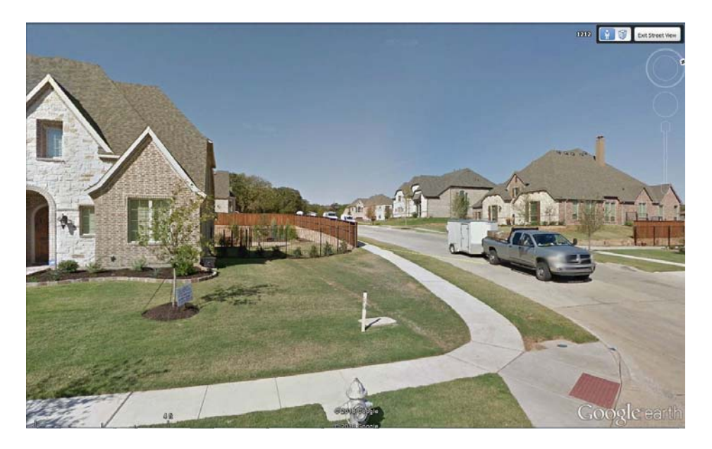
Requested UDC-18-0004 @520 Bennington Lane Front View