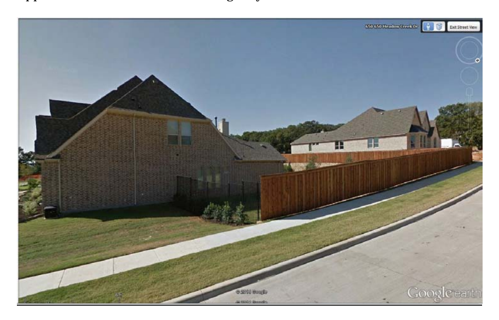
Requested UDC-18-0004 @ 520 Bennington Lane Side View