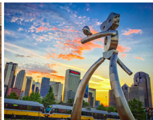
The Traveling Man-Walking Tall