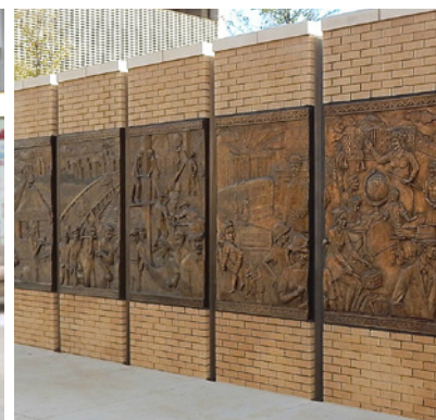
Birth of a City