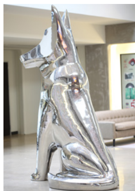
Better to Give