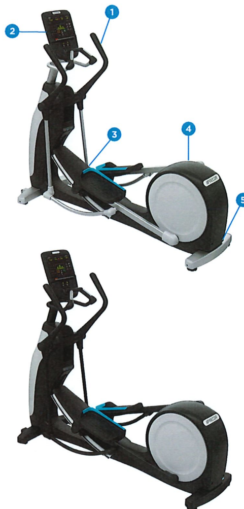
Gloss Metallic Silver

Alerts staff at a glance when the EFX needs maintenance or service.